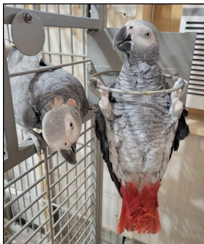
African Grey Door Dash