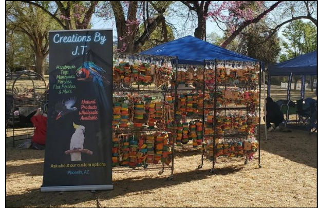
Last Year's Bird Toy Sale

Location: Inez Park 2027 Wisconsin Street NE Albuquerque, NM 87110