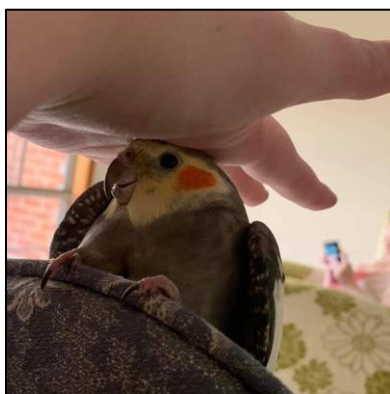
Cockatiel – Non Touchy Feely Type