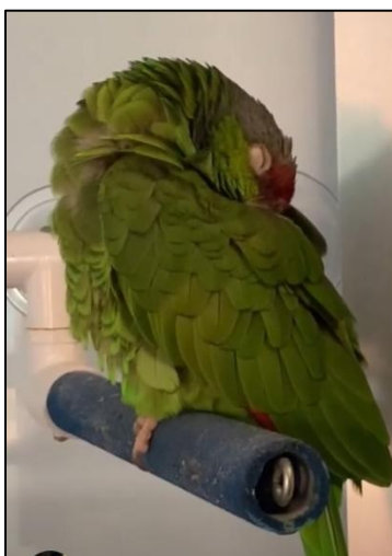
Autumn Weather is Sleeping Weather