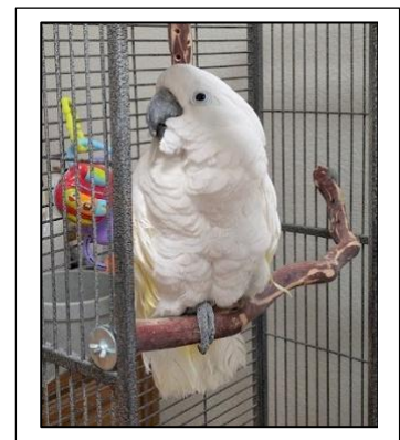
Kimo, Umbrella Cockatoo BOAF Foster Bird