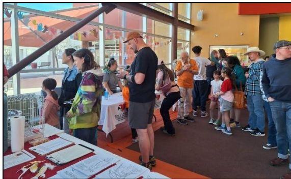
We were all in a separate area from the rest of the Garden Expo and drew quite a crowd.