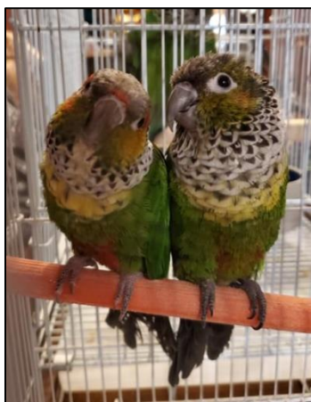
Green Cheek Conures

You can also follow them on their Facebook page at: https://www.facebook.com/birdsof Feather nm/ for current events and activities at the rescue.