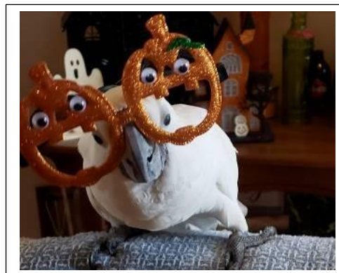
Treat or I Chew the Sofa