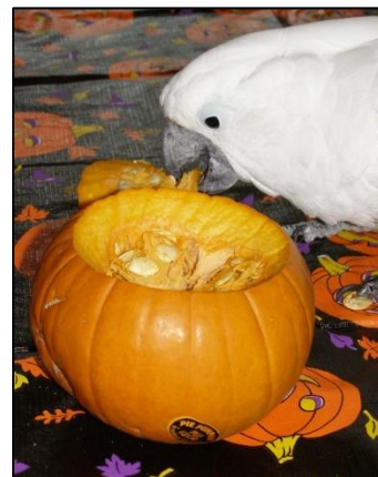
Food and Forage Fun

Responsibilities of club officers are listed in our bylaws. A copy of our bylaws is posted on our website and can be found using this link: http://www.highdesertbirdclub.org/wp-content/uploads/2012/09/HDBC-Constitution-and-By-Laws-062608-Amend-110712.pdf , under Article VI - Duties and Powers of Officers.