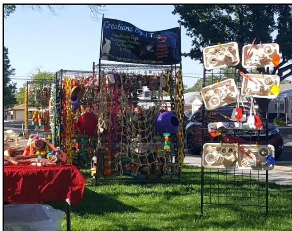
Bird Toy Sale in September 2023

The Parrot Pantry will be open on this day as well. Be sure to check out this bird toy sale for a huge selection of many of the toys available at the Parrot Pantry.