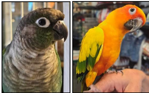
A Variety Conures are Available for Adoption

Rehoming fees and adoption policy process apply.