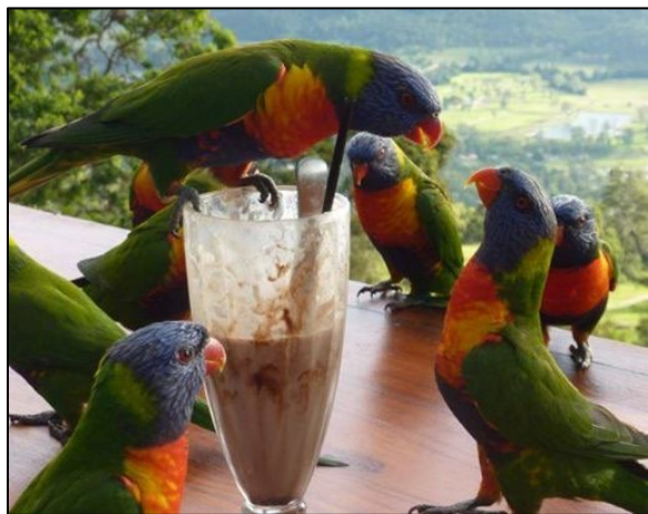
Ice Cream Anti-social

2027 Wisconsin Street NE Albuquerque, NM 87110