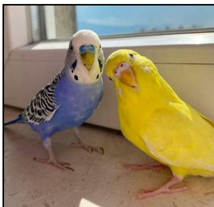
Lots of Different Budgies are Available for Adoption

Rehoming fees and adoption policy process apply.