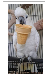
Patiently Waiting for July