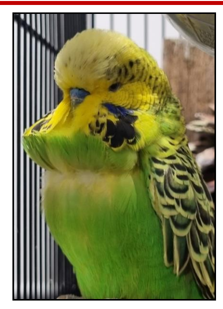
When Your Fluffer Chops Need Support