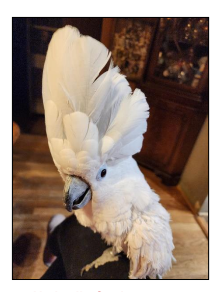
Umbrella Cockatoos are Available for Adoption

Rehoming fees and adoption policy process apply.