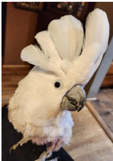
Umbrella Cockatoo Available for Adoption

Rehoming fees and adoption policy process apply.