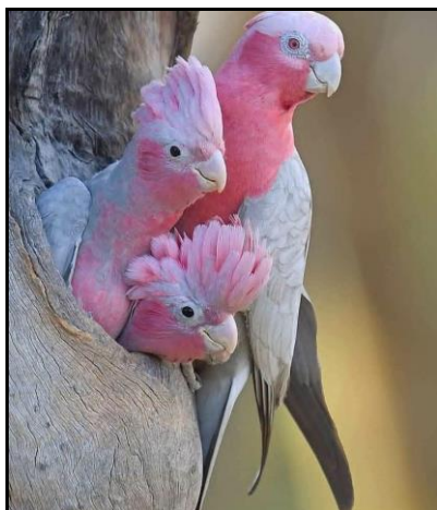
Mom and Baby Galah Cockatoos