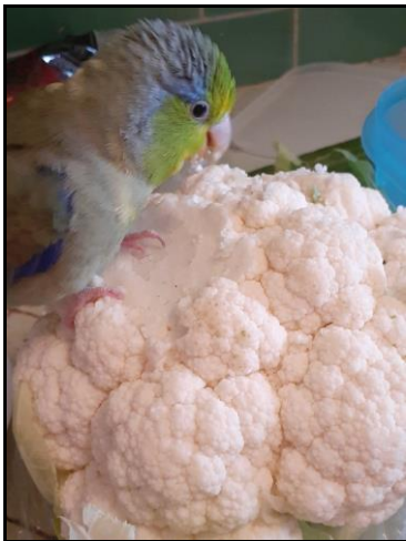
Standing on a $9 Cauliflower Like We Just Won the Lottery