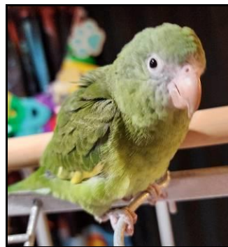
Canary-Wing Parrot Available for Adoption

Rehoming fees and adoption policy process apply.