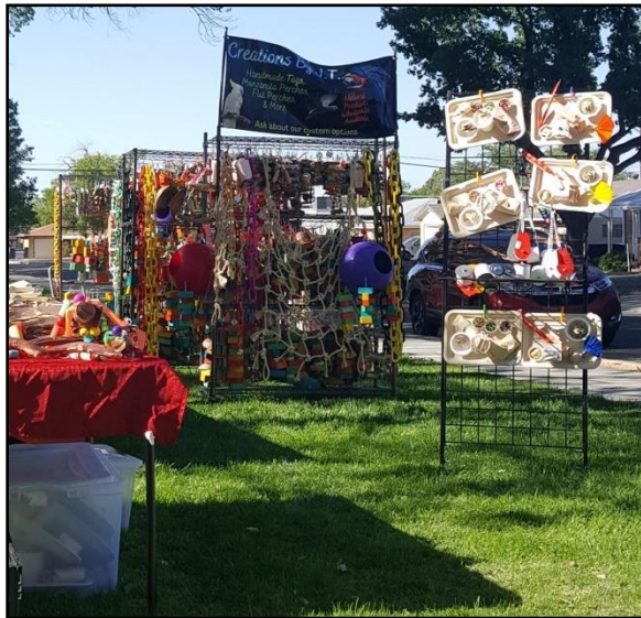
Recent Bird Toy Sale in September 2023

More details will be published as we get closer to the next sale date.