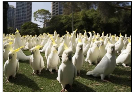
AI Graphic, But Still Creepy