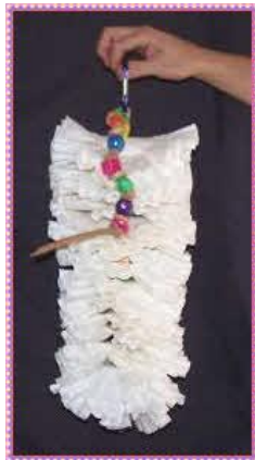
Bird Toy Made of Coffee Filters

If you haven't been to a bird club meeting in a while or yet, this one will be a really good meeting to attend. There is much going on and it will be a great way to start the New Year.