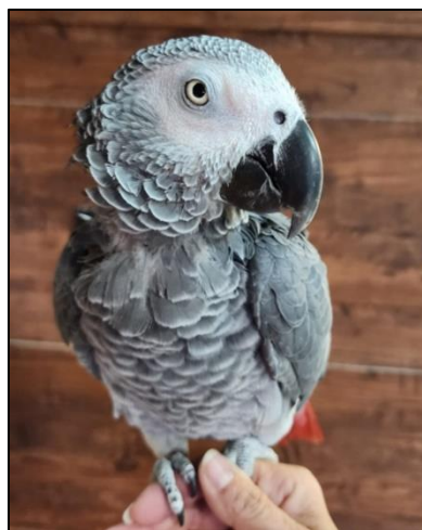
One of Many African Grey Parrots Available for Adoption

Rehoming fees and adoption policy process apply.