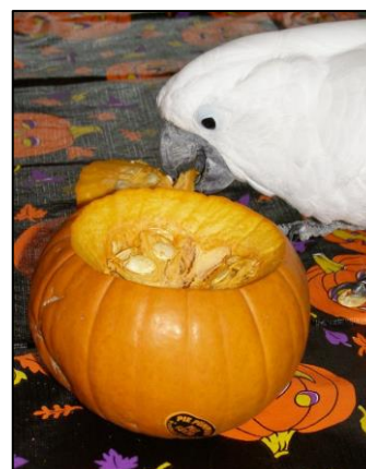
Ready for Halloween?