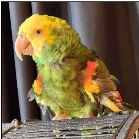
Double-Yellow Head Amazon

Here's a link to their Facebook page: https://www.facebook.com/birdsofafeathernm/ .