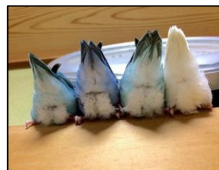
Four Quarters Make a Full Moon