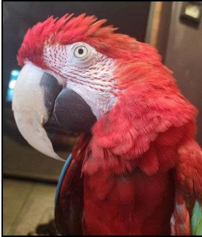
Green Wing Macaw

A variety of birds are available for adoption at Birds of a Feather Parrot Rescue of New Mexico (BOAF). HDBC is partnering with BOAF to help with receiving, fostering and rehoming pet birds.