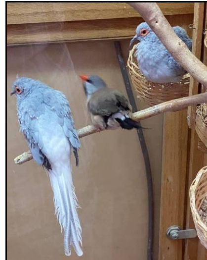
Diamond Doves and Finches

If you are interested in adopting, fostering or just want more information, please reach out to Dorothy Newbill at (505) 980-6166.