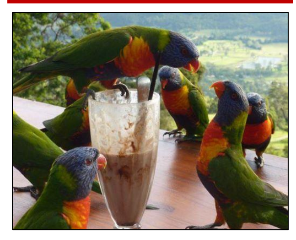
Rainbow Lorikeets Ice Cream Antisocial