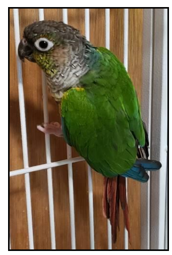
Green Cheek Conure

Rehoming fees and adoption policy process apply.