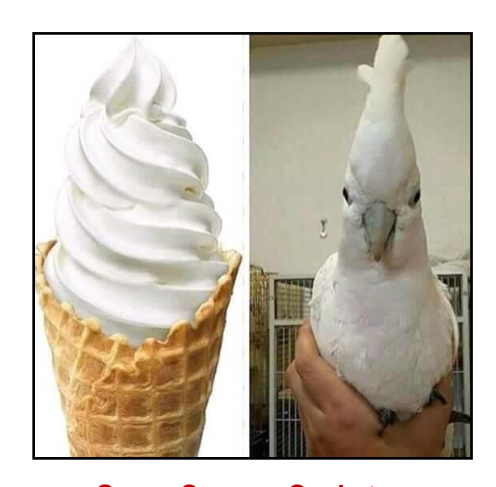
Sugar Cone or Cockatoo

Members and guests are welcome. We will be outside, so if you wish to bring a parrot, please make sure they are secure.