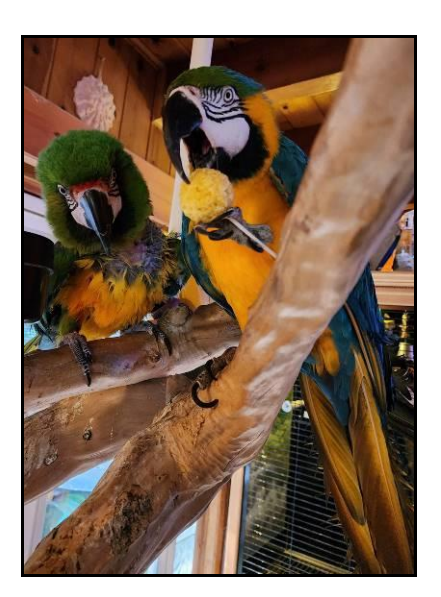
Macaws Enjoying a Treat

A variety of birds are available for adoption at Birds of a Feather Parrot Rescue of New Mexico (BFPR). HDBC is partnering with BFPR to help with receiving, fostering and rehoming pet birds.