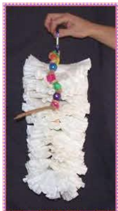
Bird Toy Made of Coffee Filters

Back by popular demand, a bird toy workshop is scheduled for our May general meeting. The club has a collection of bird toy parts and foraging items ready for assembly. Everyone is encouraged to bring additional items for making bird toys or to refresh some existing toys.