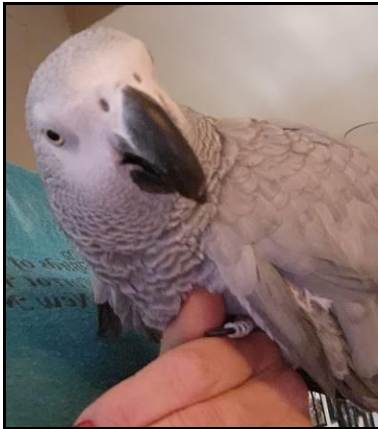
African Grey Parrot

Many helpful videos, information and forms are available on the BFPR website: https://www.birdsofafeathernm.org/