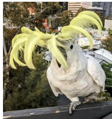
Spring is the Windiest Season in New Mexico