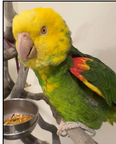
Double-Yellow Head Amazon Parrot

The rescue is at capacity and a waiting list for surrenders is in place for other than emergency situations. Meet and greet opportunities of available birds are posted on their Facebook page with information about scheduling an appointment.