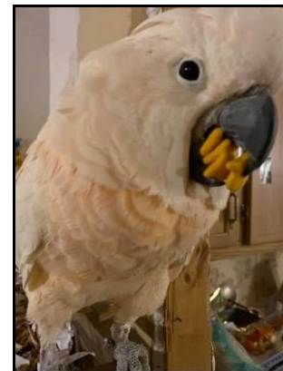
Catch of the Day