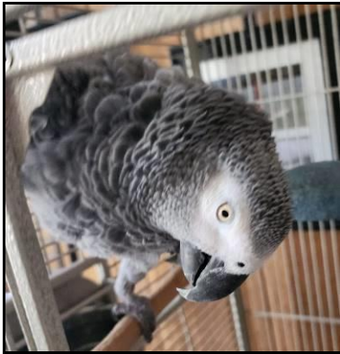
African Grey Parrot

A variety of birds are available for adoption at Birds of a Feather Parrot Rescue of New Mexico (BFPR). HDBC is partnering with BFPR to help with receiving, fostering and rehoming pet birds.