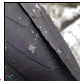
Snow on Feathers