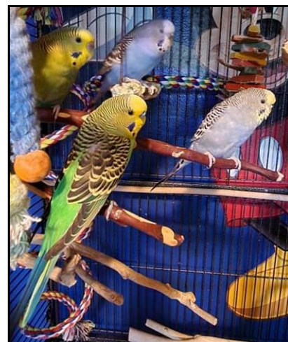
Budgies (Lots of Budgies)

Rehoming fees and adoption policy process apply.