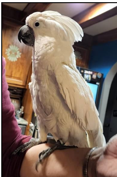
Yoshi - Umbrella Cockatoo Male

If you are interested in fostering or adopting a parrot, BFPR is a very active parrot rescue. They are always working with a variety of different pet birds from Amazons to Macaws, and the smaller birds like budgies, cockatiels, canaries and finches. They've even had some hand-tame doves available for adoption.