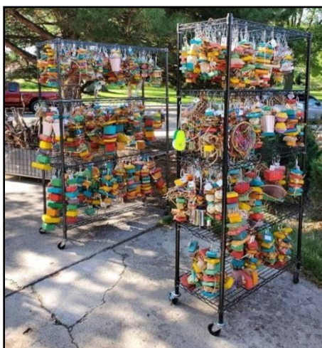
Racks of Bird Toys for all Types of Parrots

Facebook: https://www.facebook.com/Creations-By-JT-Bird-Toys-270955316336106/