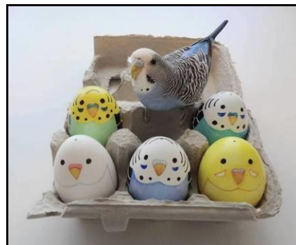
Very Fancy Easter Eggs