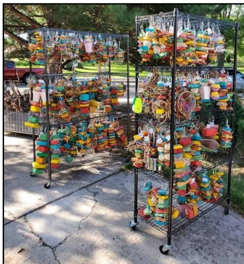
Racks of Bird Toys for all Types of Parrots

Facebook: https://www.facebook.com/Creations-By-JT-Bird-Toys-270955316336106/