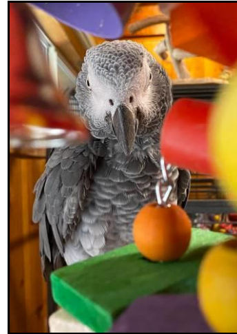
African Grey Parrot

They are always working with a variety of different pet birds from Amazons to Macaws, and the smaller birds like budgies, cockatiels, canaries and finches. They've even had some hand-tame doves available for adoption.